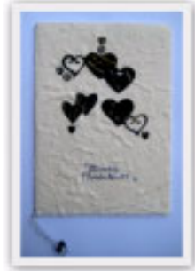
No. 12211 10 x 15 cm