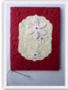
No. 12023 10 x 15 cm