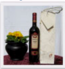
No. 12302 (33x9x9cm)