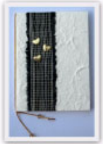
No. 12105 8 x 11 cm