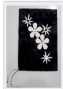
No. 12115 8 x 11 cm