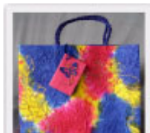
Gift bag (20x26x8cm) No. 12350