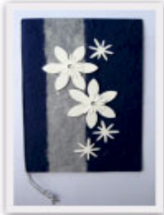
No. 12025 10 x 15 cm