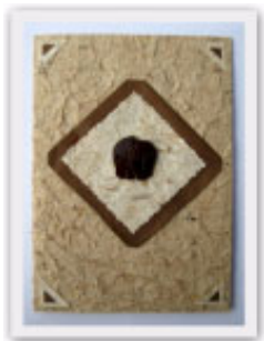
No. 12007 10 x 15 cm