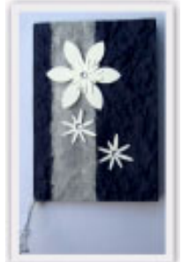
No. 12108 8 x 11 cm

Handmade cards of Thai SA-paper. All cards individual packed with envelope and neutral innercard.