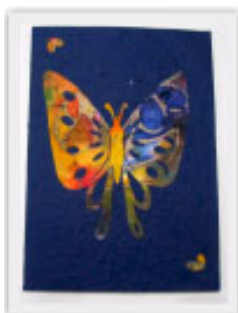
No. 12003 10 x 15 cm