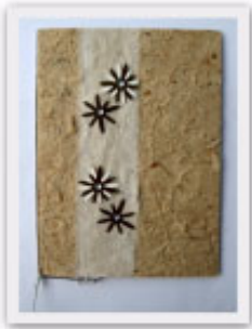
No. 12021 10 x 15 cm