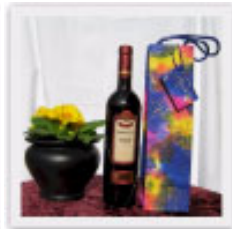
No. 12303 (33x9x9cm)