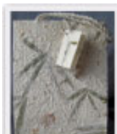
Gift bag (25x20x9,5cm) No. 12340