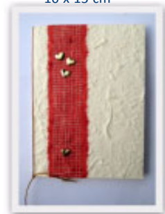
No. 12015 10 x 15 cm