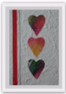
No. 12101 8 x 11 cm