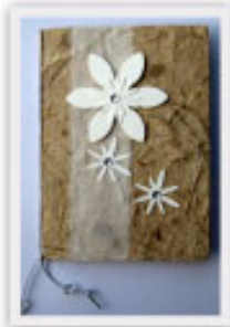
No. 12110 8 x 11 cm