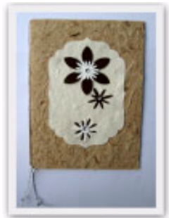
No. 12020 10 x 15 cm