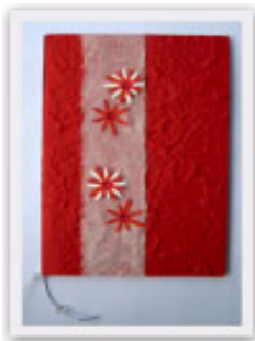
No. 12018 10 x 15 cm