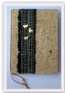
No. 12104 8 x 11 cm