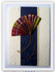
No. 12009 10 x 15 cm