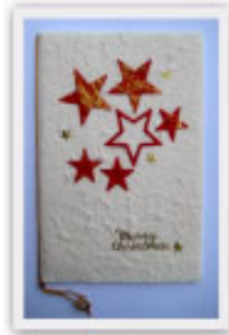
No. 12206 10 x 15 cm