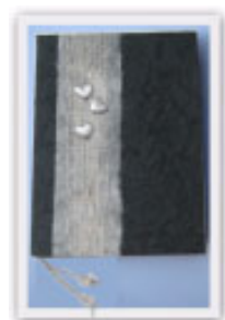
No. 12116 8 x 11 cm