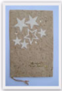
No. 12205 10 x 15 cm