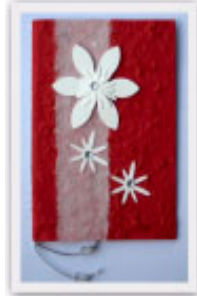
No. 12107 8 x 11 cm