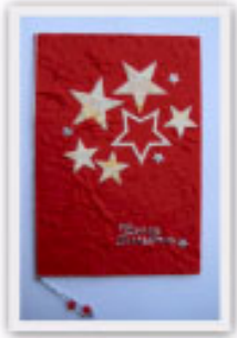
No. 12208 10 x 15 cm

Handmade cards of Thai SA-paper. All cards individual packed with envelope and neutral innercard.