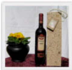
No. 12301 (33x9x9cm)