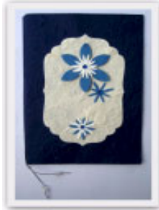
No. 12026 10 x 15 cm