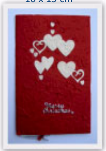
No. 12212 10 x 15 cm