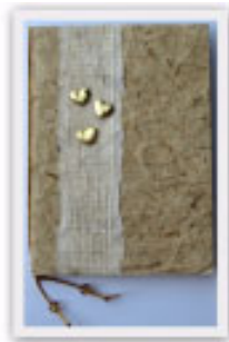
No. 12103 8 x 11 cm