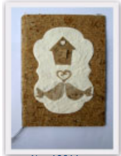
No. 12011 10 x 15 cm