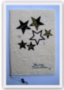
No. 12207 10 x 15 cm

Handmade cards of Thai SA-paper. All cards individual packed with envelope and neutral innercard.