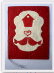
No. 12010 10 x 15 cm