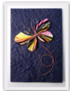
No. 12008 10 x 15 cm