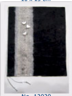
No. 12029 10 x 15 cm