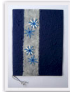
No. 12027 10 x 15 cm