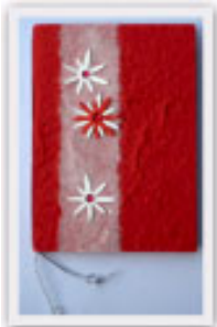
No. 12111 8 x 11 cm