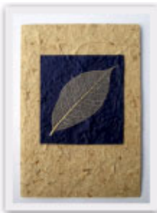
No. 12006 10 x 15 cm