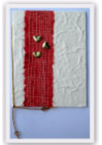
No. 12106 8 x 11 cm