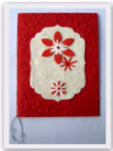
No. 12017 10 x 15 cm