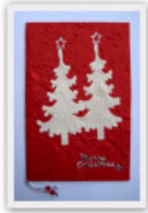
No. 12204 10 x 15 cm