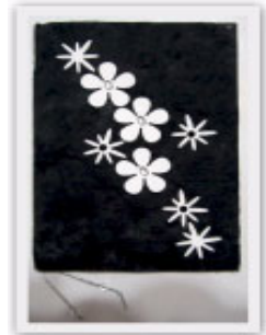
No. 12028 10 x 15 cm