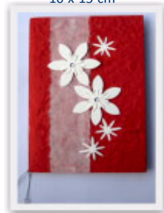
No. 12016 10 x 15 cm