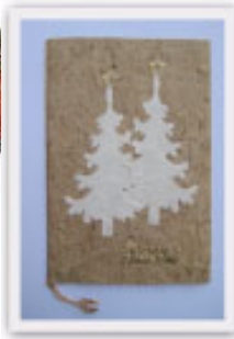
No. 12201 10 x 15 cm