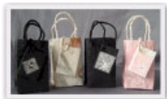
Gift bags (9x5,5x4cm) No. 12320 - black No. 12321 - white No. 12322 - pink