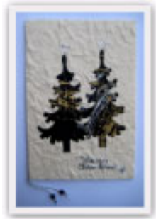
No. 12203 10 x 15 cm