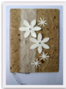
No. 12019 10 x 15 cm