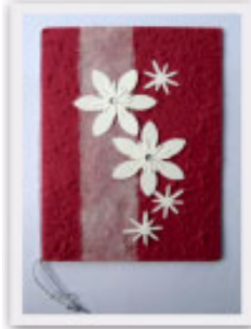
No. 12022 10 x 15 cm