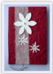
No. 12109 8 x 11 cm

Handmade cards of Thai SA-paper. All cards individual packed with envelope and neutral innercard.