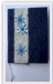
No. 12113 8 x 11 cm