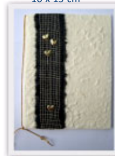
No. 12014 10 x 15 cm