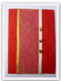
No. 12004 10 x 15 cm