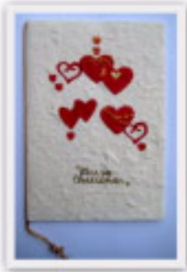
No. 12210 10 x 15 cm