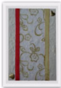
No. 12102 8 x 11 cm