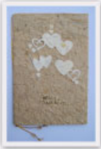
No. 12209 10 x 15 cm