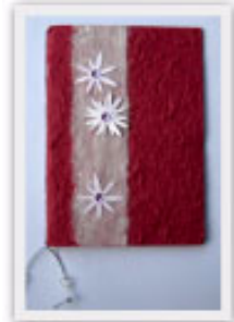
No. 12112 8 x 11 cm