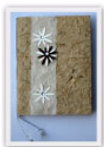
No. 12114 8 x 11 cm