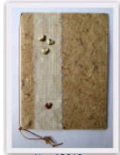
No. 12012 10 x 15 cm