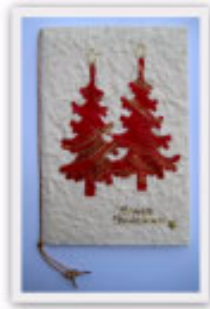
No. 12202 10 x 15 cm