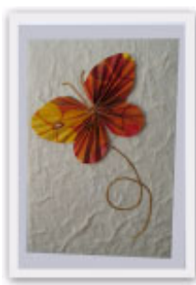
No. 12002 10 x 15 cm