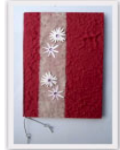
No. 12024 10 x 15 cm