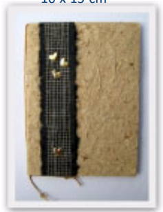
No. 12013 10 x 15 cm