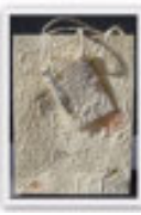
Gift bag (13x10x5cm) No. 12330