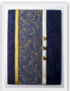
No. 12005 10 x 15 cm