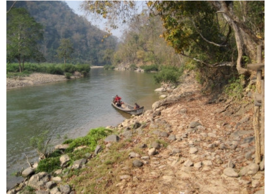
From the Mae Hong Son area

Thankyou for your prayers and support. ■