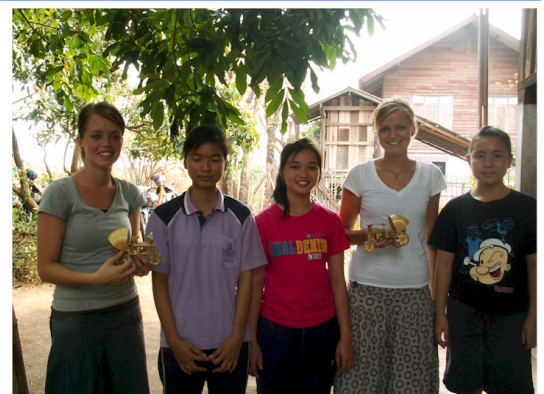
The 3 girls together with 2 volunteers

The 3 girls, all from Doi Law, have throughout several years been unpaid volunteers for AIDS Care, and we have decided to acknowledge their help and assistance in Sunday school and English teaching.